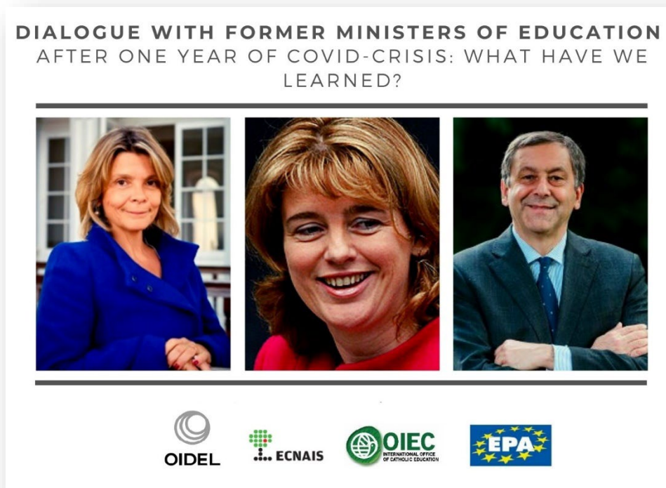
Maria do Carmo Seabra

On May 11, 2021, OIDEL organized, in collaboration with OIEC, ECNAIS, and EPA, an online colloquium with former education ministers Maria do Carmo Seabra from Portugal, Ruth Kelly from the UK, and Francesco Profumo from Italy.