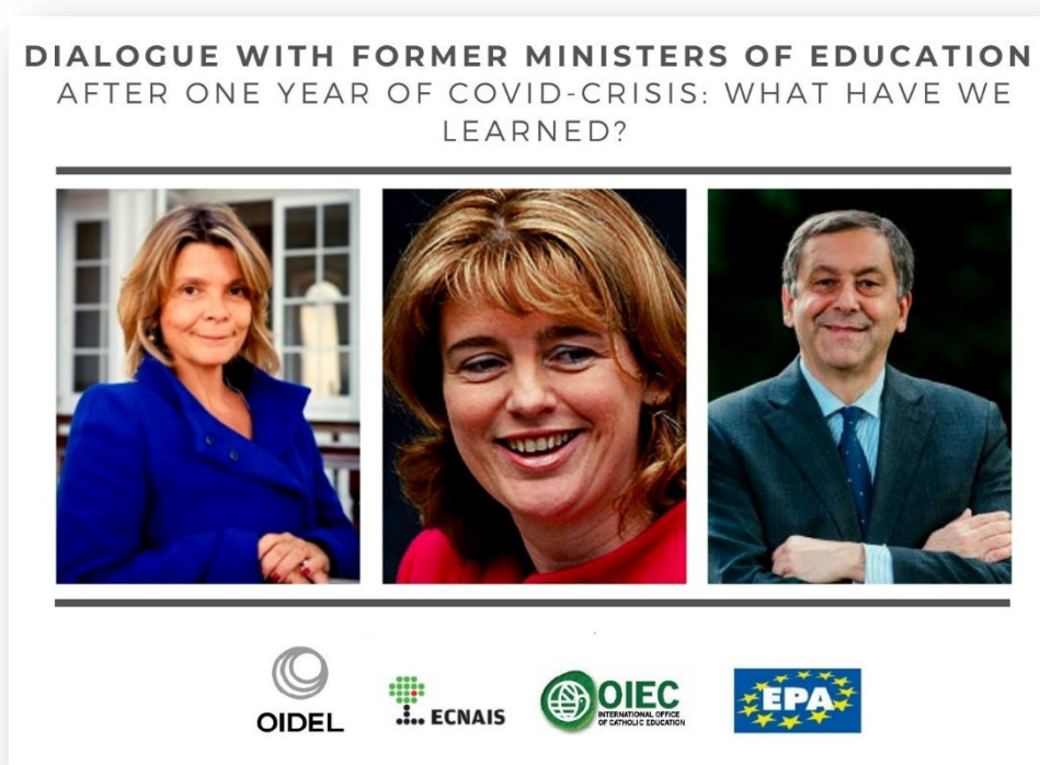
Maria do Carmo Seabra

On May 11, 2021, OIDEL organized, in collaboration with OIEC, ECNAIS, and EPA, an online colloquium with former education ministers Maria do Carmo Seabra from Portugal, Ruth Kelly from the UK, and Francesco Profumo from Italy.